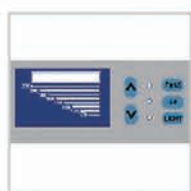
LED Display Microprocessor control system, LED display