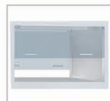
Double Sides Double sides work bench, operators can sit face to face